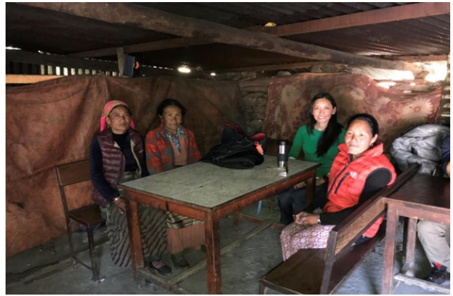
Clockwise from left: Women’s group in Rasuwa; mixed group of participants at Salme Bazar, Solukhumbu; women’s group at Lamabagar, Dolakha and; mixed group of participants at Dordi Village Municipality, Lamjung

the drop by one-third of peak prices in 2014 to today, enthusiasm for shares remain unabated.